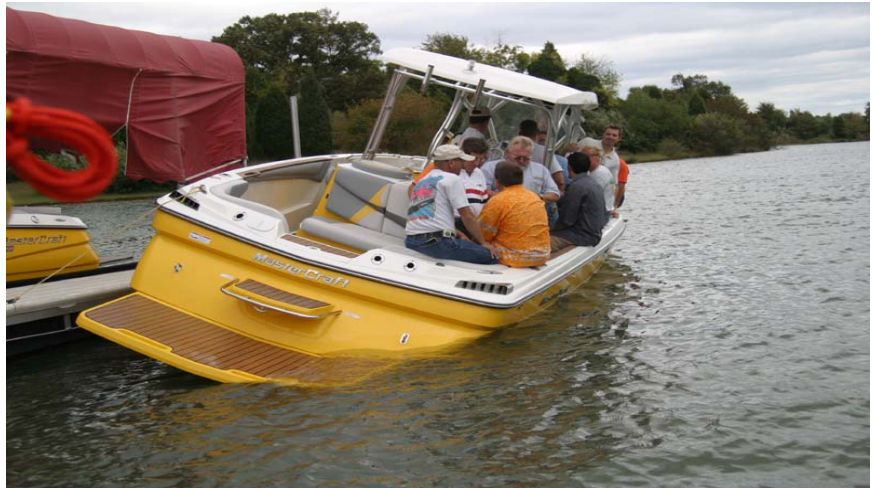
The 2008 Mastercraft 265 undergoing an Inclination Test.

After the show we then went to Tennessee to CE Mark two new Mastercraft boats to be launched in 2008. Whilst there we were invited to the new 375,000 sq ft production facility next door, opened by Cobalt Boats, to handle production of their new venture into the large motor yacht market. Two new boats are in production, a 37ft and 46ft. Confidentiality agreements prevent us from discussing any great detail here, but suffice to say that these two new boats are both beautifully engineered. Some of the features integrated in to the designs are very European and both boats are at the forefront of technology available today. The official launch of both boats will be the Miami Boat Show in February.