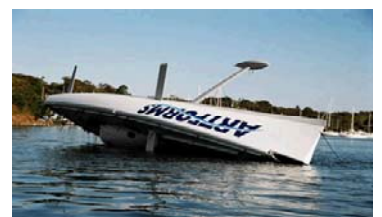
The other way!