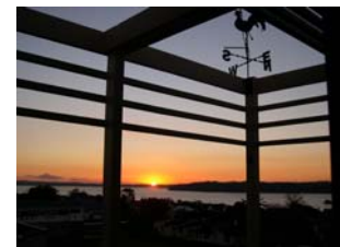
Winter Solstice at the New Zealand Office: 21 st June 2007

Phone: +90 216 392 71 71 Fax: +90 216 392 98 00 Email: turkey@ceproof.com