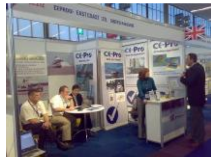
CEproof stand at the Dublin Boat Show

c/o PI-ES Shipping, Tourism, Trading Ltd. Guzelyali mah. Sahil yolu cad. Yakut sok.26/4 34903 Pendik, Istanbul: Turkiye Phone: +90 216 392 71 71 Fax: +90 216 392 98 00 Email: turkey@ceproof.com