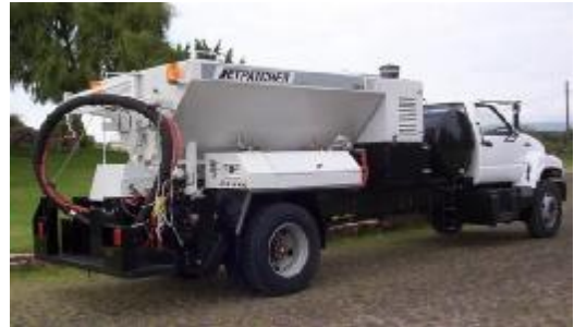
A Jetpatcher mounted on a truck chassis